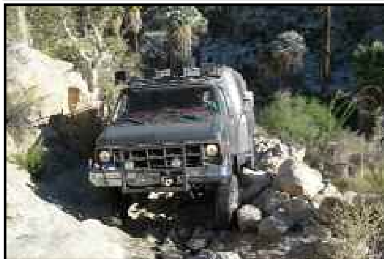
More Road !?