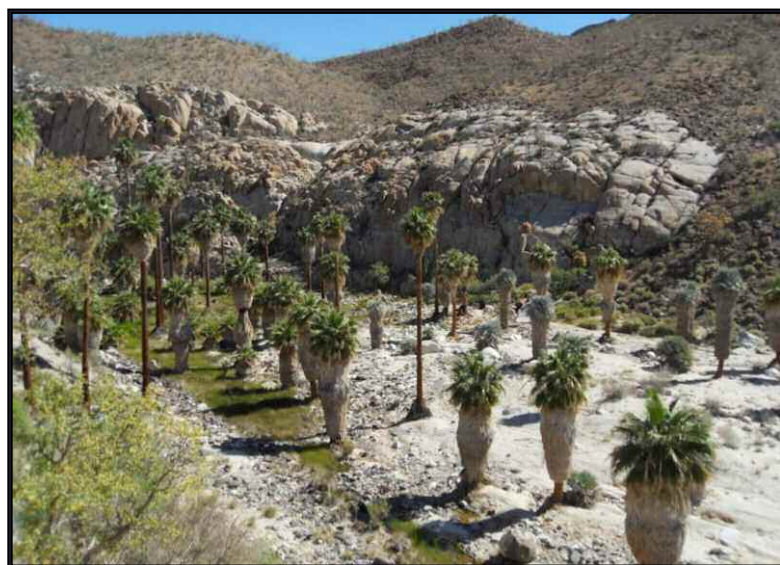
Oasis at Santa Maria