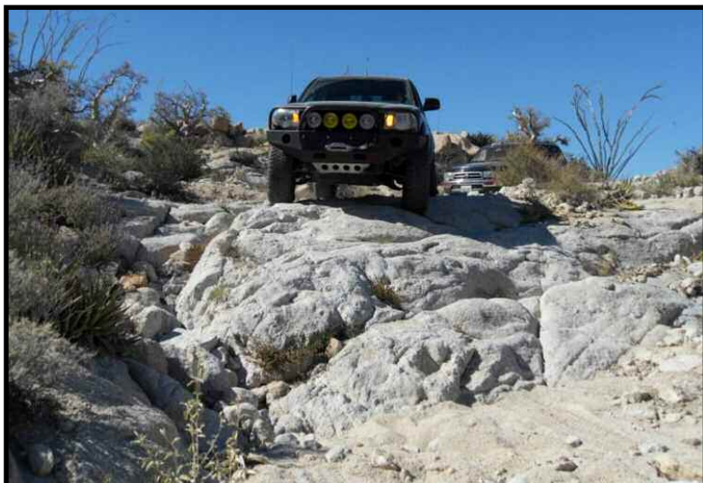
The Road (!?) to Santa Maria

Arriving at the Mission, we admired the choice location and the concomitant view. Then on the way out, things got really interesting. The road did it to me again! Different dip, different palm tree,